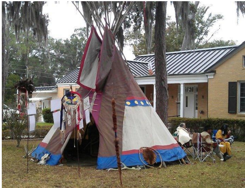
Nov. 2012 Flags and Feathers Native American Festival at the Lake City VA Medical Center